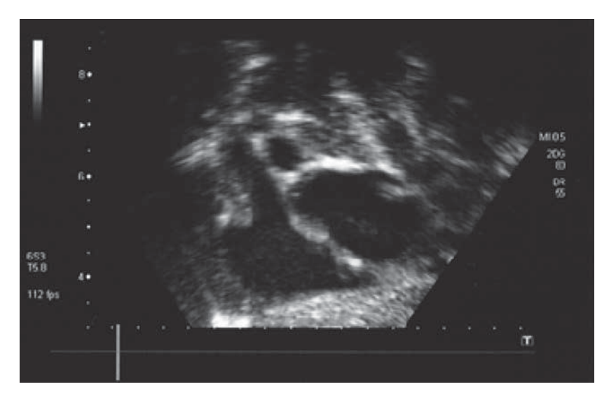
Figure 2. Complete dissolution of the intraatrial thrombus after the third dose of alteplase.

hours. Subsequent ECHO showed no changes in thrombus size, so a second dose of alteplase was administered into the proximal catheter. After another two hours, ECHO showed significant reduction in thrombus size. The third dose of alteplase was administered into the proximal catheter 24 hours later. After a dwelling time of 2 hours, ECHO revealed complete resolution of the thrombus (figure 2).